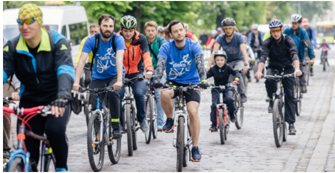
Our specialists taking part in Lviv Bike Day

In 2019, we began a partnership with homeless animal charity Myloserdya